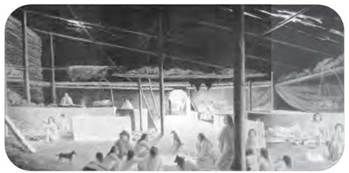
Shed style longhouse interior, Klallam Salish