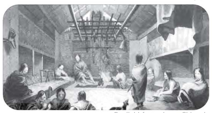
Daylight from above, Chinook