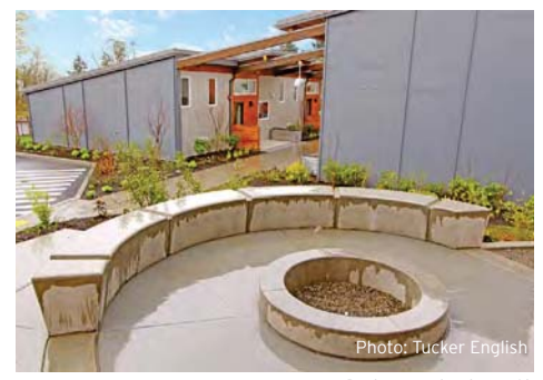
Salmon bake pit

The project site is located in a wooded, suburban area adjacent to 27 units of Puyallup Nation Housing Authority (PNHA) rental townhouses built in the 1980s. The site originally included an abandoned youth home and a deteriorated gymnasium. The wooded area is sloped, overlooking the Puget Sound tidal flats, with a wildlife corridor on the lower slope, which has been redeveloped with a nature trail leading to a sweat lodge area. Rain gardens and native plants help to provide a natural setting, minimize irrigation, and protect the Puget Sound from runoff. The site amenities include a dance arbor, playground, salmon-bake pit, sweat lodge area, and walking trail.